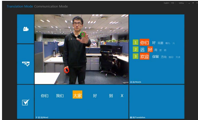
(a) Translation mode