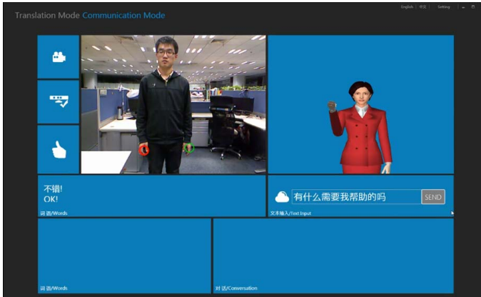
(b) Communication mode